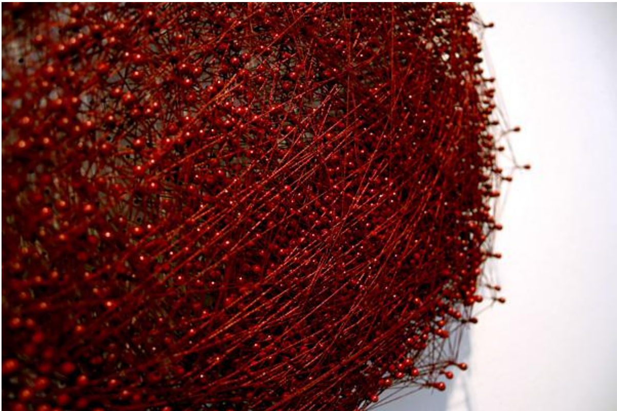
TANGLED PATHWAYS 2 pins, enamel, and thread 49" x 106" x 1.5" © KATIE LEWIS