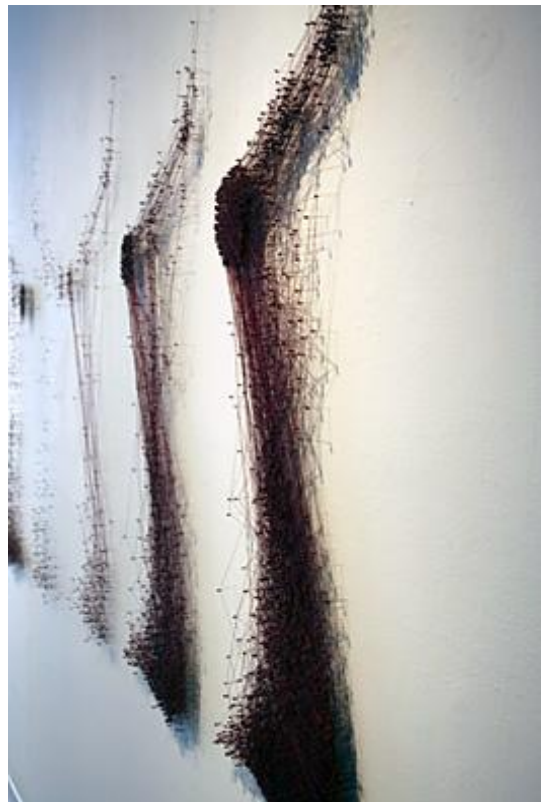
TANGLED PATHWAYS 1 pins, enamel, thread: 49" x 106" x 1.5" © KATIE LEWIS