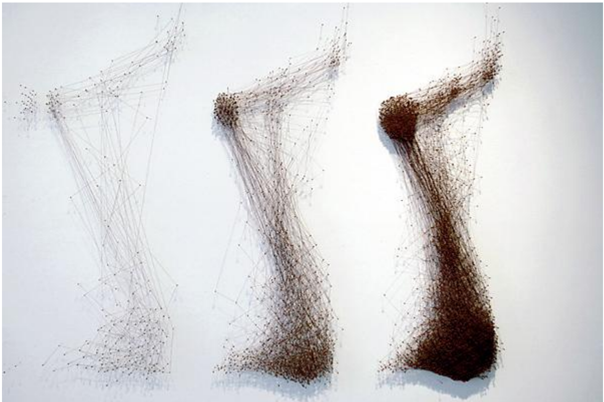
TANGLED PATHWAYS 4 pins, enamel, and thread 49" x 106" x 1.5" © KATIE LEWIS