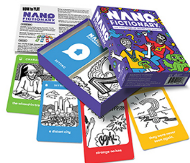
The Nano - Fiction Game