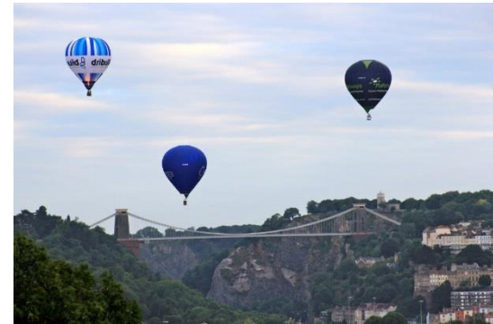
CC-BY 2.0 Emma Bishop on FLICKR. Photo taken 9/08/2013 https://bit.ly/2xIzDUK