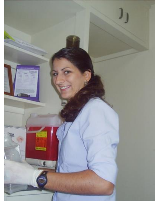
Nurse practitioner, 2005.