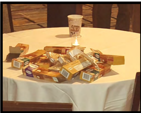
Lots of ice cream bar wrappers, hopefully this means that the ice cream was good!