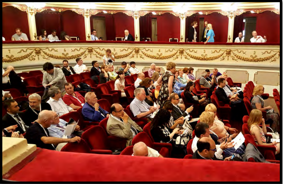
Gathering for the opening plenary session at the Teatro Marrucino.