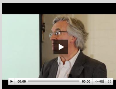
Film on Mentalisation

Maternal reflective functioning, mother-infant affective communication, and infant attachment: Exploring the link between mental states and observed caregiving behavior in the intergenerational transmission of attachment