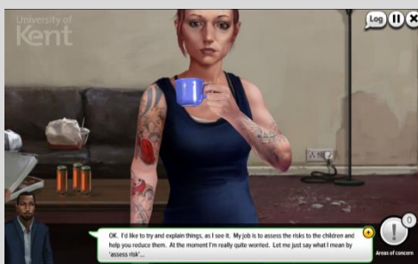
Mentalisation and attachment