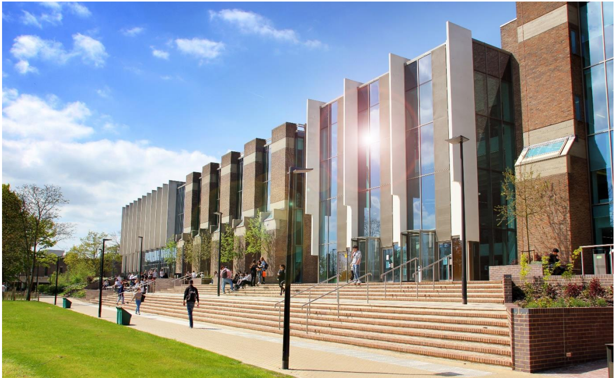
Templeman Library.