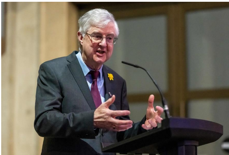
The future of social democracy in Britain