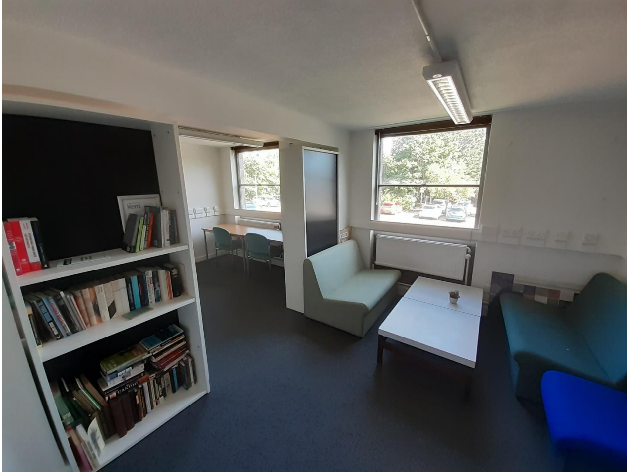
Keynes, C staircase, 1 st floor, room 7 (C1 07)