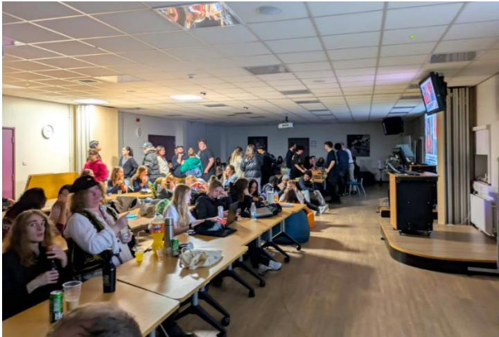
On the US election