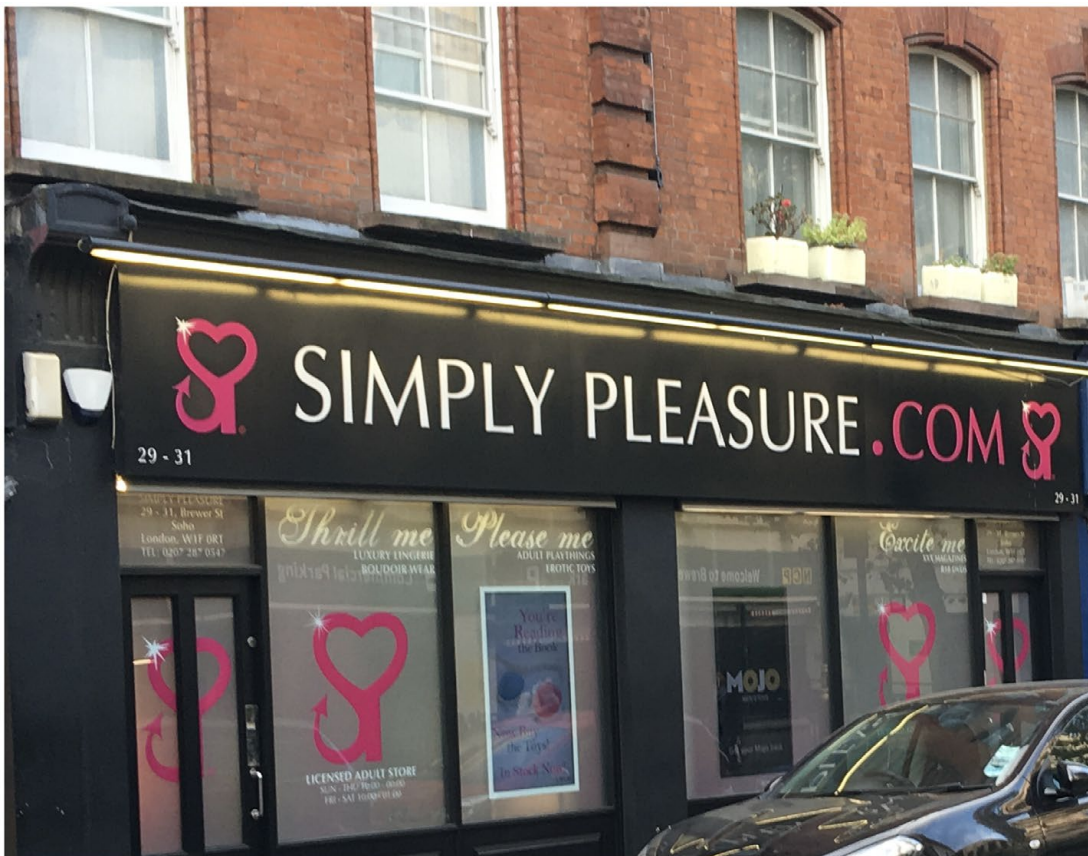
Figure 2. Simply Pleasure.