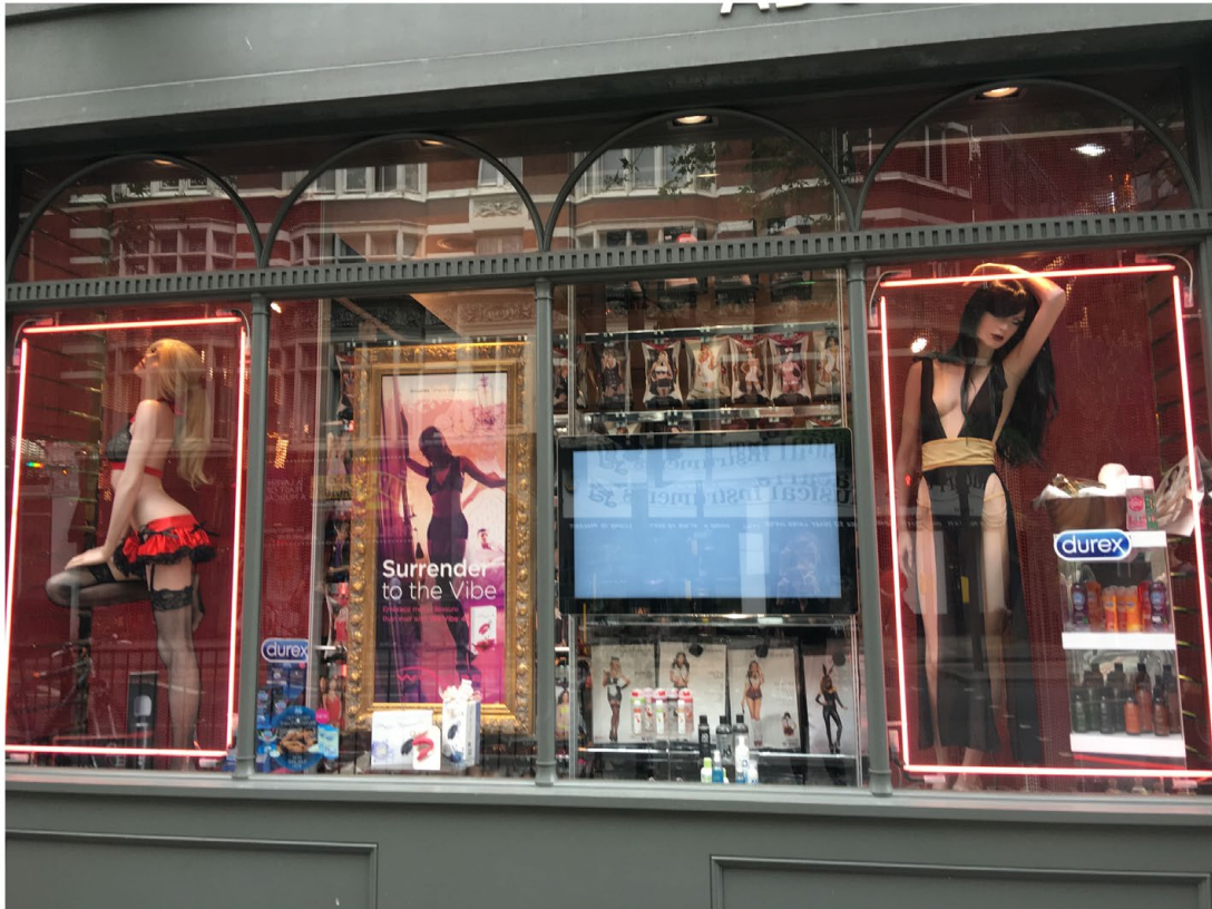
Figure 1. Harmony.