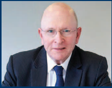
CHSS news Page 2