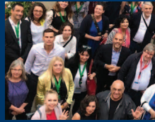
International news Page 4