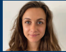
Staff updates Page 7