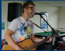
CHSS people Page 6